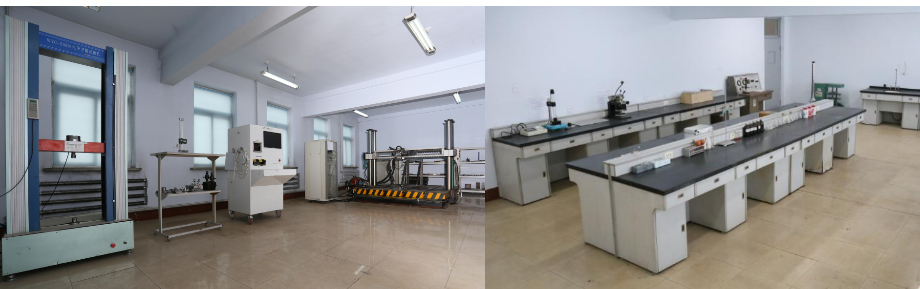
Physical & chemical test lab of GINYO